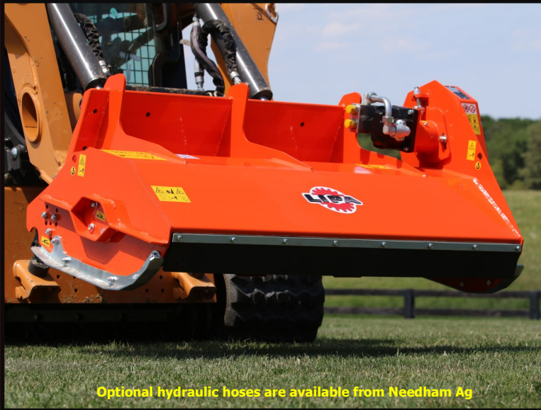
Optional hydraulic hoses are available from Needham Ag

The TLB-F models are designed for smaller to medium sized skid steer loaders which have sufficient auxiliary oil flow (see chart below for required oil flow per minute).