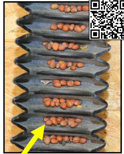
Radish seeds hanging in a factory seed tube angled at only 30 degrees from vertical.