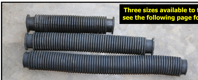
Three sizes available to fit most drills, see the following page for dimensions.